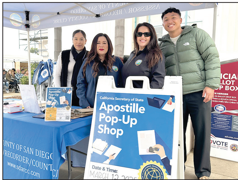
Top photos show some of the staff of the San Diego County Assessor-Recorder-County Clerk (ARCC) as they welcome the customers who braved the cold and rain to get their paperworks processed during the Apostille Pop-Up Shop in the County Administration Building